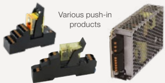
Various push-in products

Using spring-loaded technology: Push-in products, which can be easily wired by simply plugging in the terminals, can reduce wiring work and achieve stable quality compared to screw products. This provides benefits that reform how work is done at manufacturing sites, including prevention of errors by less experienced workers and reduction of overtime work.