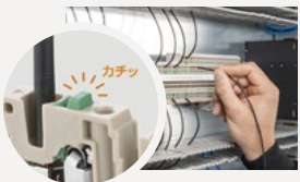
Snap-in type enables visual/aural confirmation of wiring connection